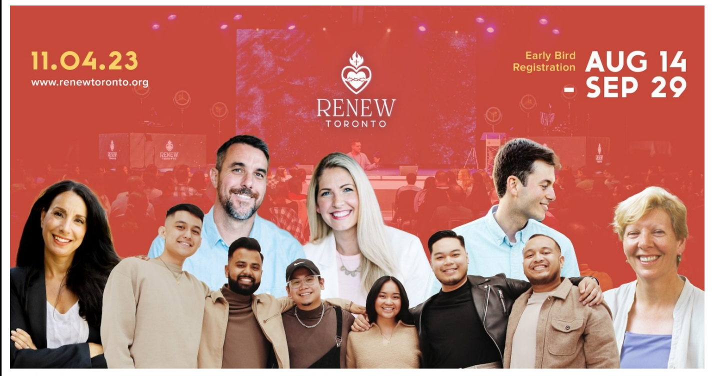
Join Us! Early Bird Opens August 14 to September 29

A group from St. James will be attending!