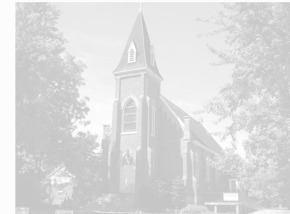
St. Francis Xavier