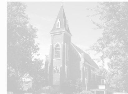
St. Francis Xavier

2118 Adjala-Tecumseth Townline, Colgan, L0G 1W0