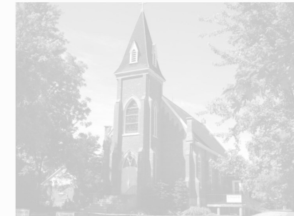
St. Francis Xavier

2118 Adjala-Tecumseth Townline, Colgan, LOG 1W0